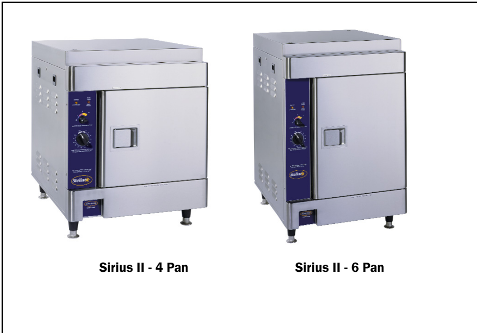
Sirius II - 4 Pan

MODELS: SIRIUS II - 4 Pan SIRIUS II - 6 Pan